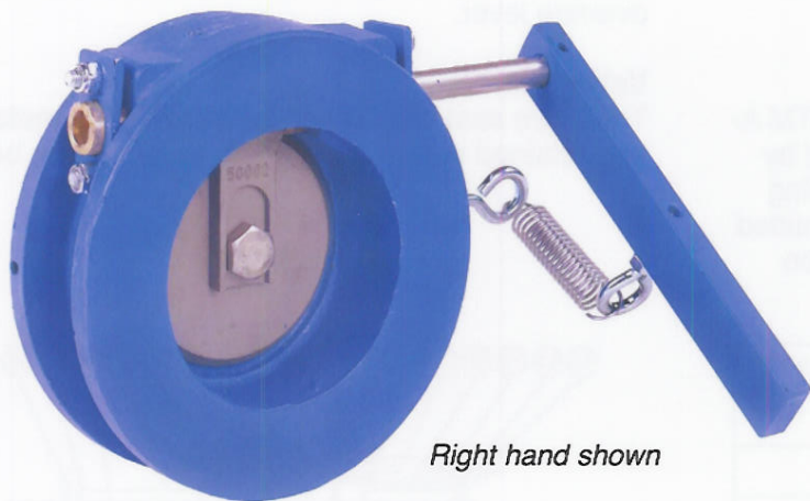
Right hand shown